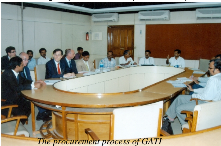
The procurement process of GATI

Government of Odisha asked the Procurement Contracting Unit-OMGI (PCU-OMGI), now CMGI-Center for Modernizing Government Initiative to carry out the tendering process to select the agency for the development and operations of GATI at Bhubaneswar. The CMGI