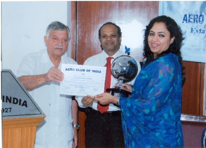
Receiving Trophy for 2nd Best Performing Flying Institute in India from Captain Satish Sharma

After the revival of GATI, was awarded 2nd Best Performing Flying Academy in India for the year of 2010–2011 by Aero Club of India, New Delhi on 30th September 2011.