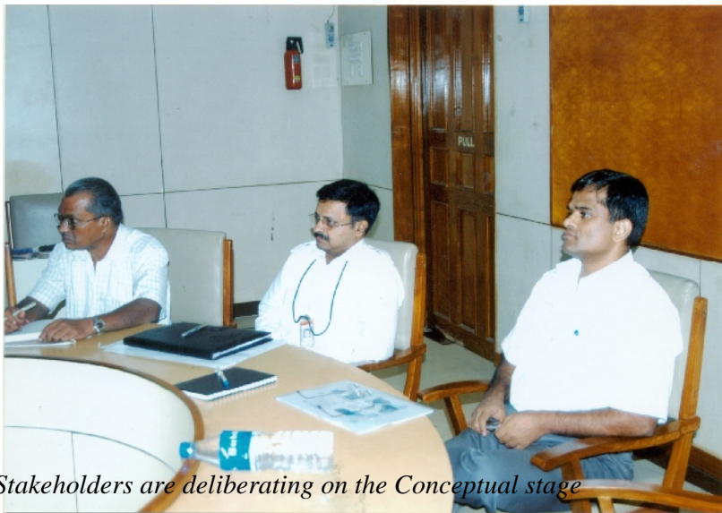
Stakeholders are deliberating on the Conceptual stage

The main Stakeholders for the development of GATI are Director of Aviation, General Administration Department, DGCA and Government Aviation Training Institute. The main role of the stakeholders is to develop the Government Aviation Training Institute into a full-fledged, commercially viable state of