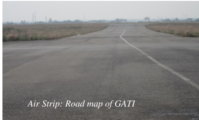
Air Strip: Road map of GATI

Immediate commencement of training operations for PPL (within 2 months) and CPL (within 6 months) has started at GATI with necessary infrastructural, professional and management support. Capital investment in a phased manner has invested to develop the institute as per the work plan finalized.