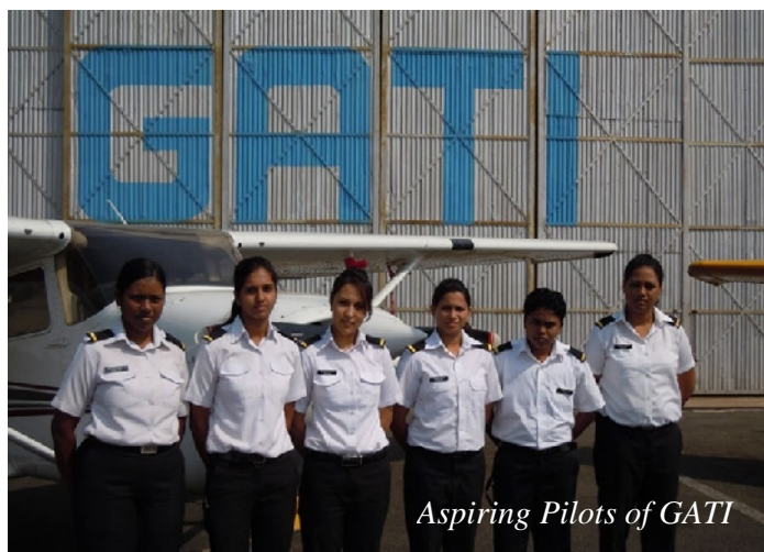
Aspiring Pilots of GATI

GATI (Government Aviation Training Institute) was set up in 1946 to bring about a quantum improvement in the standards of flying and ground training of commercial pilots in the country as Odisha Flying Club. It was merged with the Odisha Government Aviation Department in 1974 and Government Aviation Training Institute (GATI) came into being. Since then, the institute has