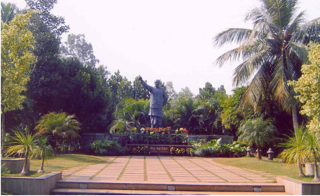
Green and Clean Bhubaneswar